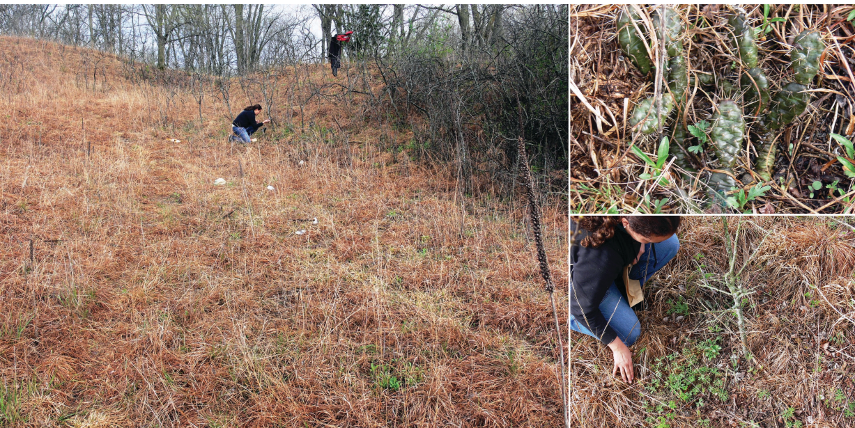
▲ LEFT As we collect data at the Hardin County Site, pieces of paper are used to mark clusters of prickly pears along the ground. TOP RIGHT Unlike the Buchanan population, the plants here, just 70 miles east, look healthy, although the pads are still slightly wrinkled from their winter dormancy. BOTTOM RIGHT Nestled in the grass, O. fragilis is not easy to find! Verónica is brushing dead grass away from a plant so she can count the pads.

ered cabin deep in Michigan’s Upper Peninsula, I contacted several Iowan herbaria (plant museums), looked up Opuntia fragilis in Eilers and Roosa’s 1994 flora of Iowa, and contacted the Iowa Department of Natural Resources (DNR), where eventually I was put in touch with John Pearson, who tracks rare plants in the state.